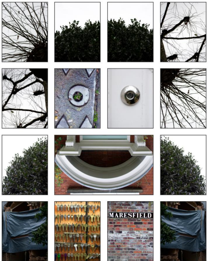
The Phantom of Farley Farm